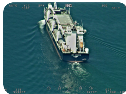
Video interface with onboard cameras